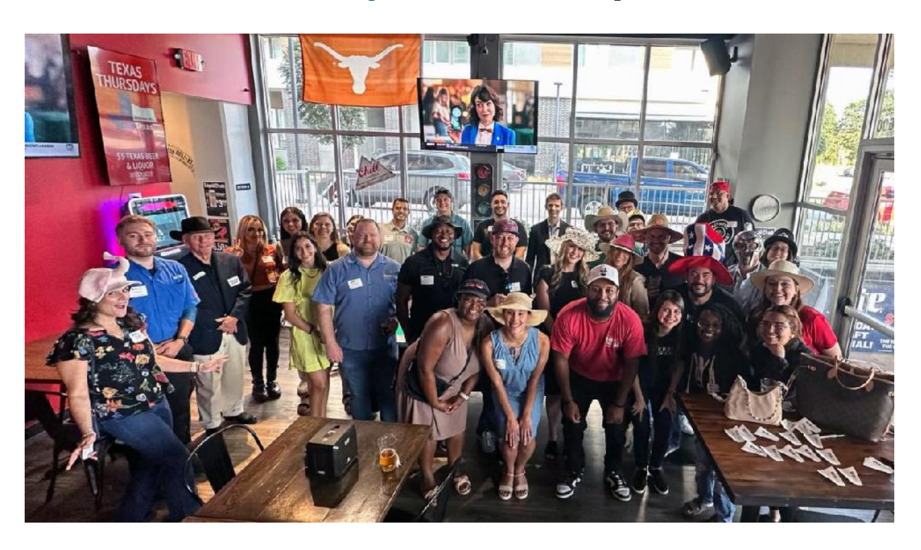
RYP was all hats at its monthly social on Aug. 31 at Mad Hatter.