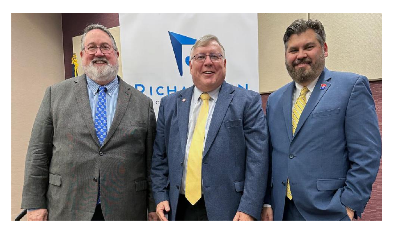
The Chamber's Workforce Development Committee presented the State of Higher