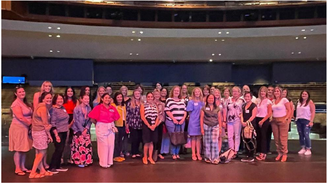
For its July social, WIL enjoyed a tour of the Eisemann Center.