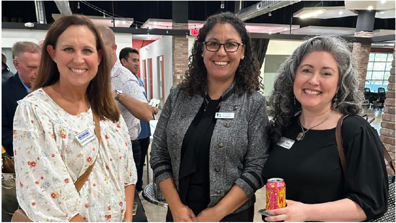
It was a great turnout for our Member Connections Happy Hour on Aug. 29 hosted by The Drawing Board with catering by Nomis.