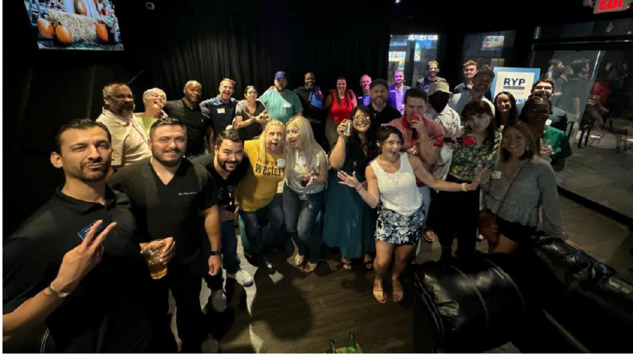
RYP sang the night away at bb.q Chicken for its July social.