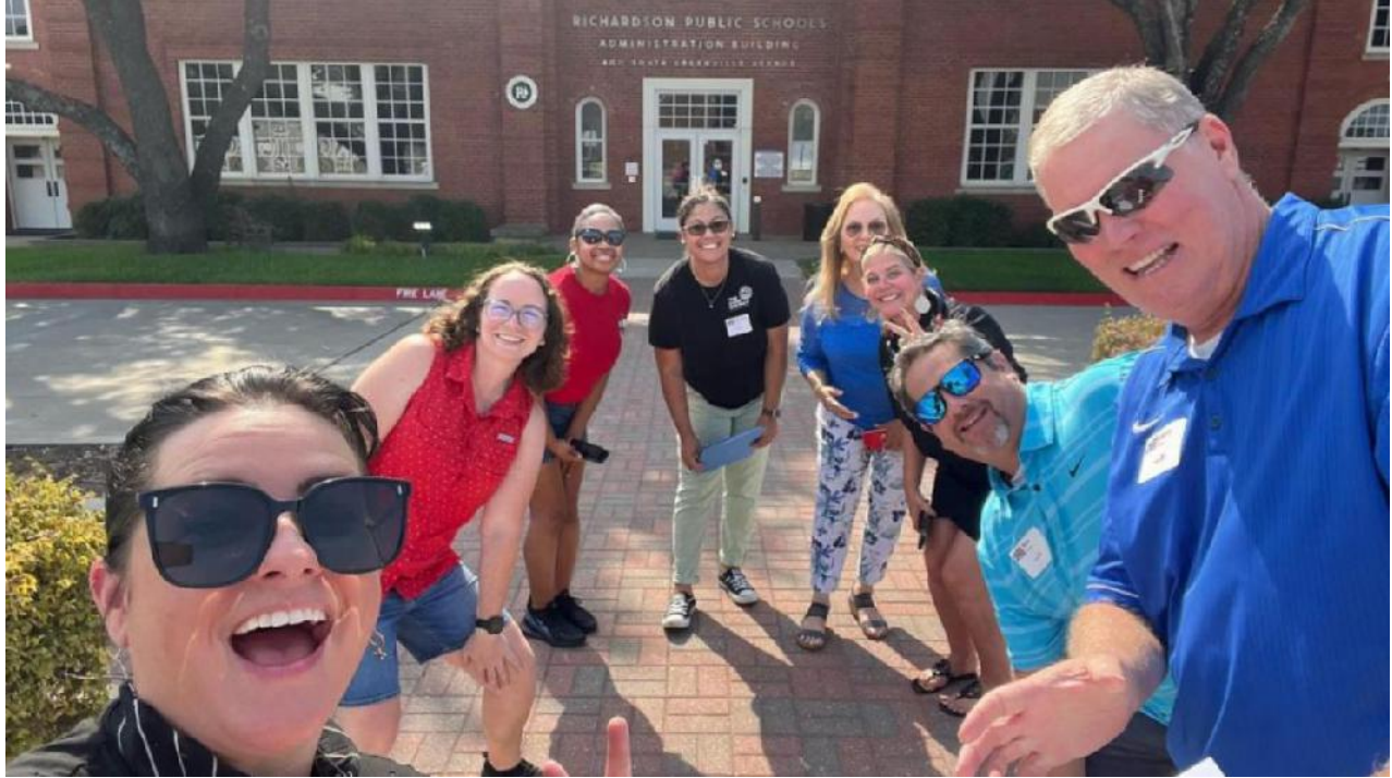
Leadership Richardson Class 39 kicked off last week with the program's annual Road Rally and Welcome Dinner, hosted by Dallas College Richland Campus.