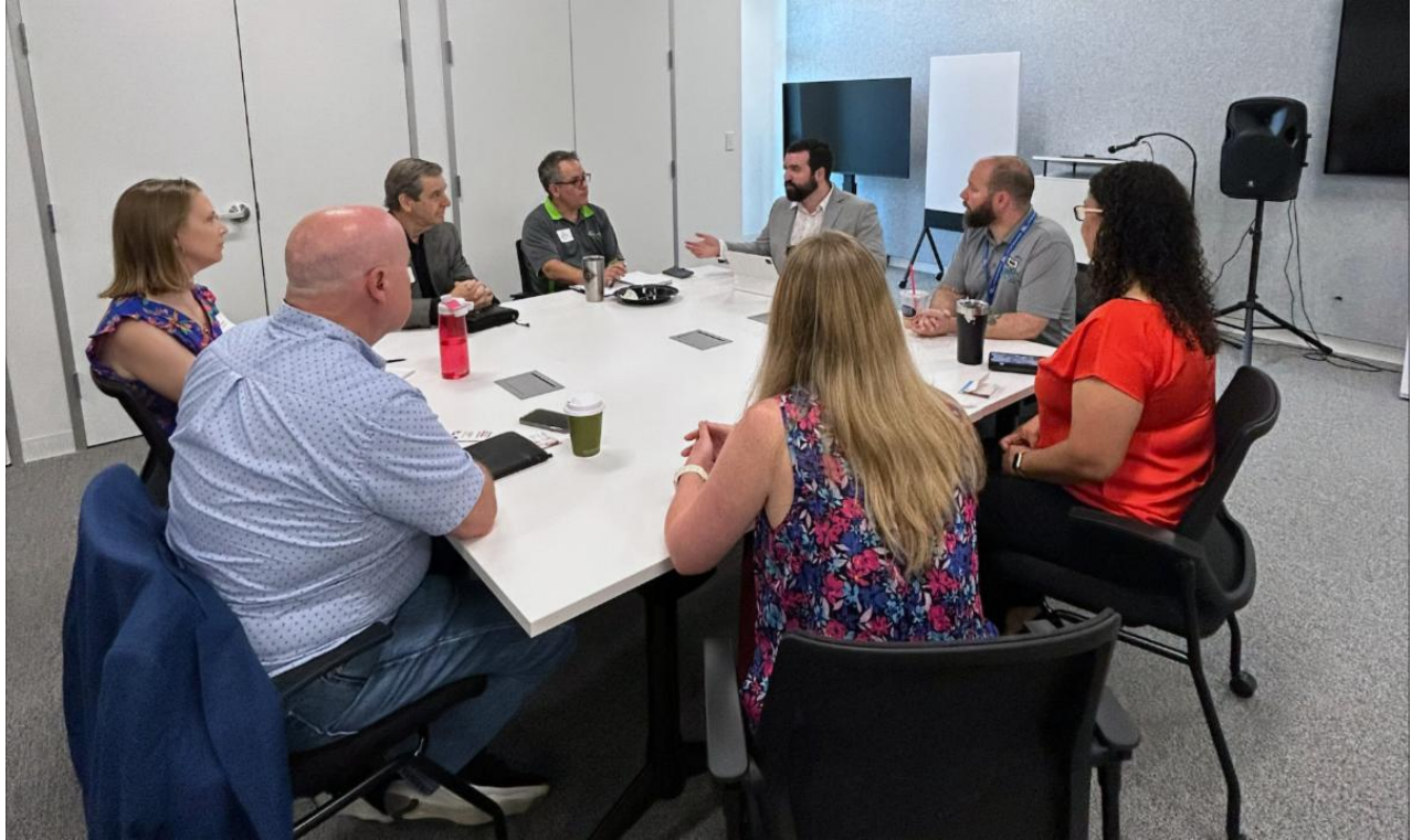
Small business owners met with representatives from The University of Texas at Dallas, Dallas Area Rapid Transit, Richardson Economic Development Department, SCORE, and the Chamber at Local Business Resource Roundup on June 27 to learn more about the resources available to local businesses. Upcoming events will zero in on marketing and HR resources.