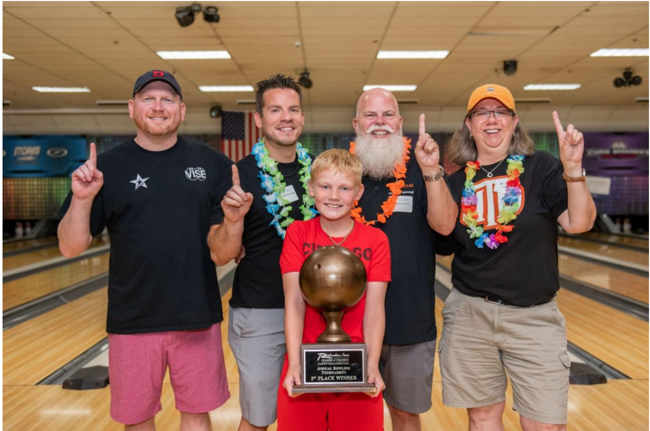
For the fourth consecutive year, The University of Texas at Dallas took the 1st Place trophy at our annual Bowling Tournament last week. Talk about bragging rights!