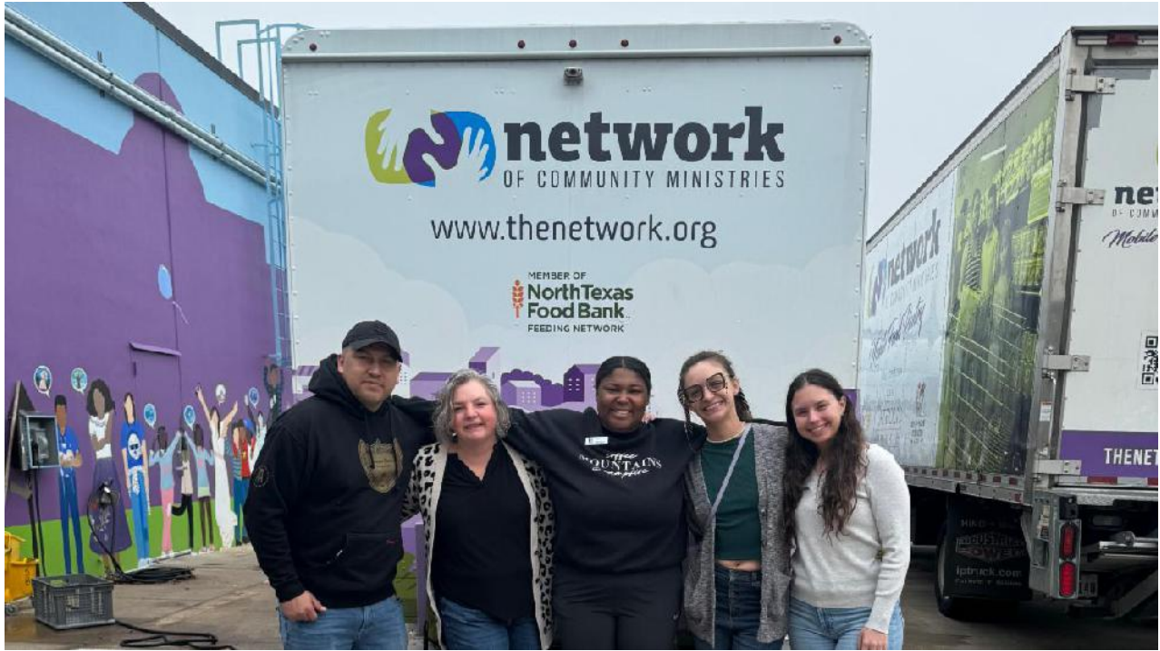
RYP volunteered at Network of Community Ministries on March 16.