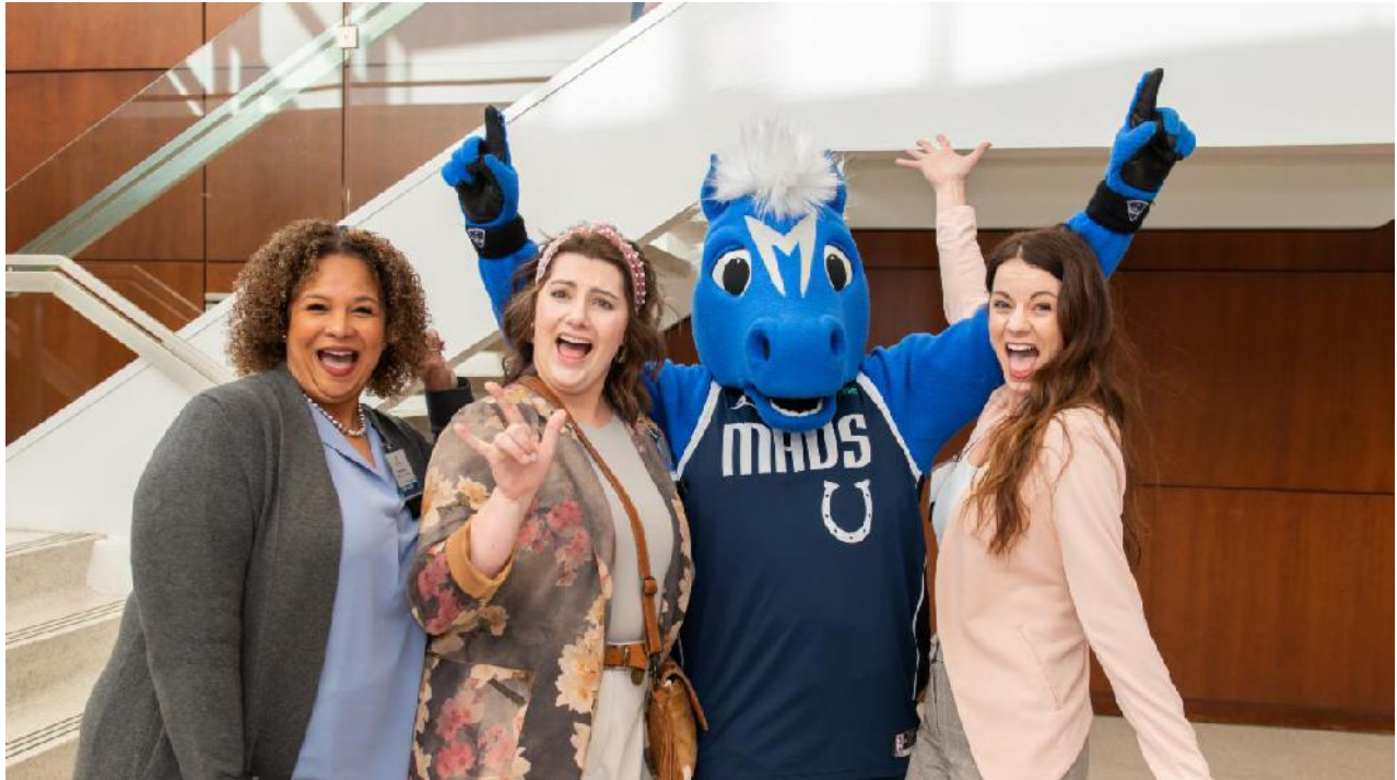
Even Champ , the Dallas Mavericks' mascot, joined the celebration!

The Chamber thanks the City of Richardson and all of the event sponsors that made the evening possible: