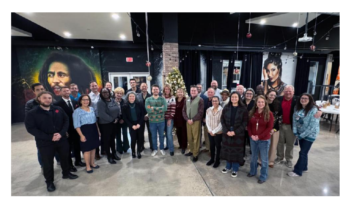
Business Network held its Jingle Mingle Holiday Party and ornament exchange at The Drawing Board on December 6, sponsored by DorianBahr .