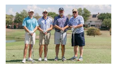
Golf Classic September 24