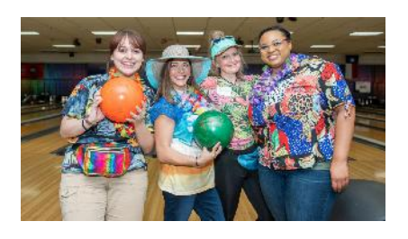
Bowling Tournament June 28