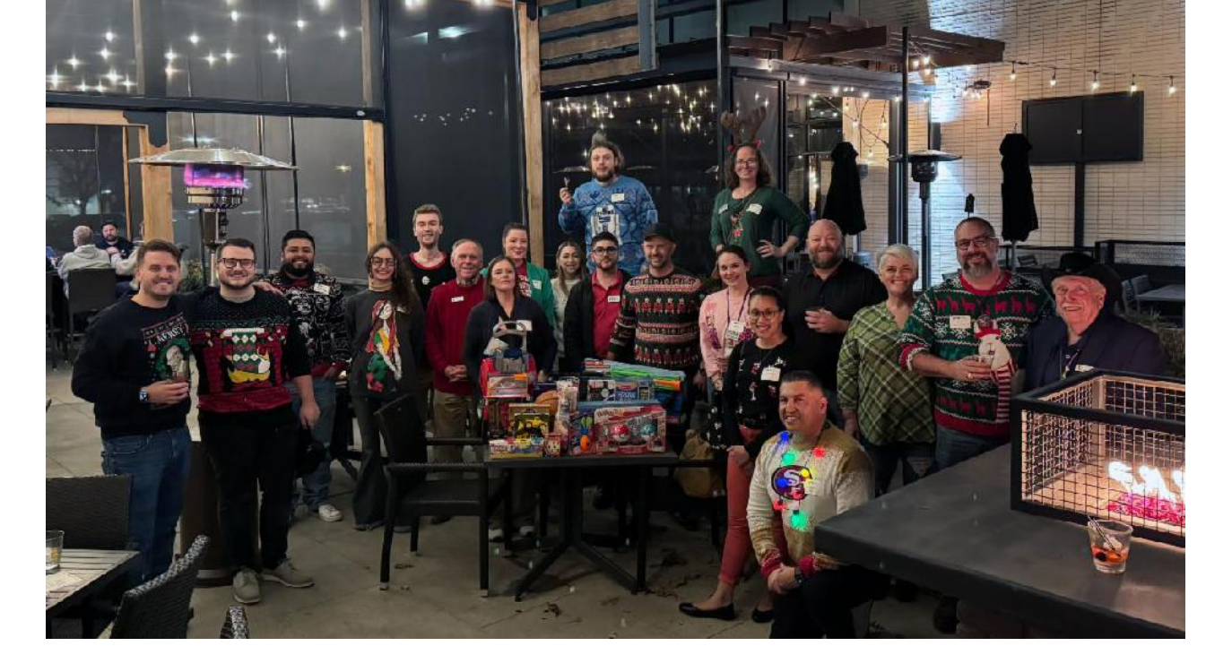
RYP held an Ugly Sweater Holiday Party at Wildwood on December 7. Guests donated toys for donation to <u>Network of Community Ministries</u>. The event was sponsored by <u>Rescue Air</u> and <u>Bilsky Financial Group</u>.