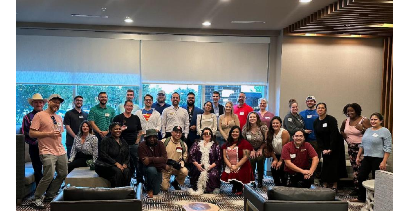
It was a spooktacular evening at the Cambria Hotel on October 26 for RYP's Creepy Connections Happy Hour sponsored by Rescue Air and Bilsky Financial Group.