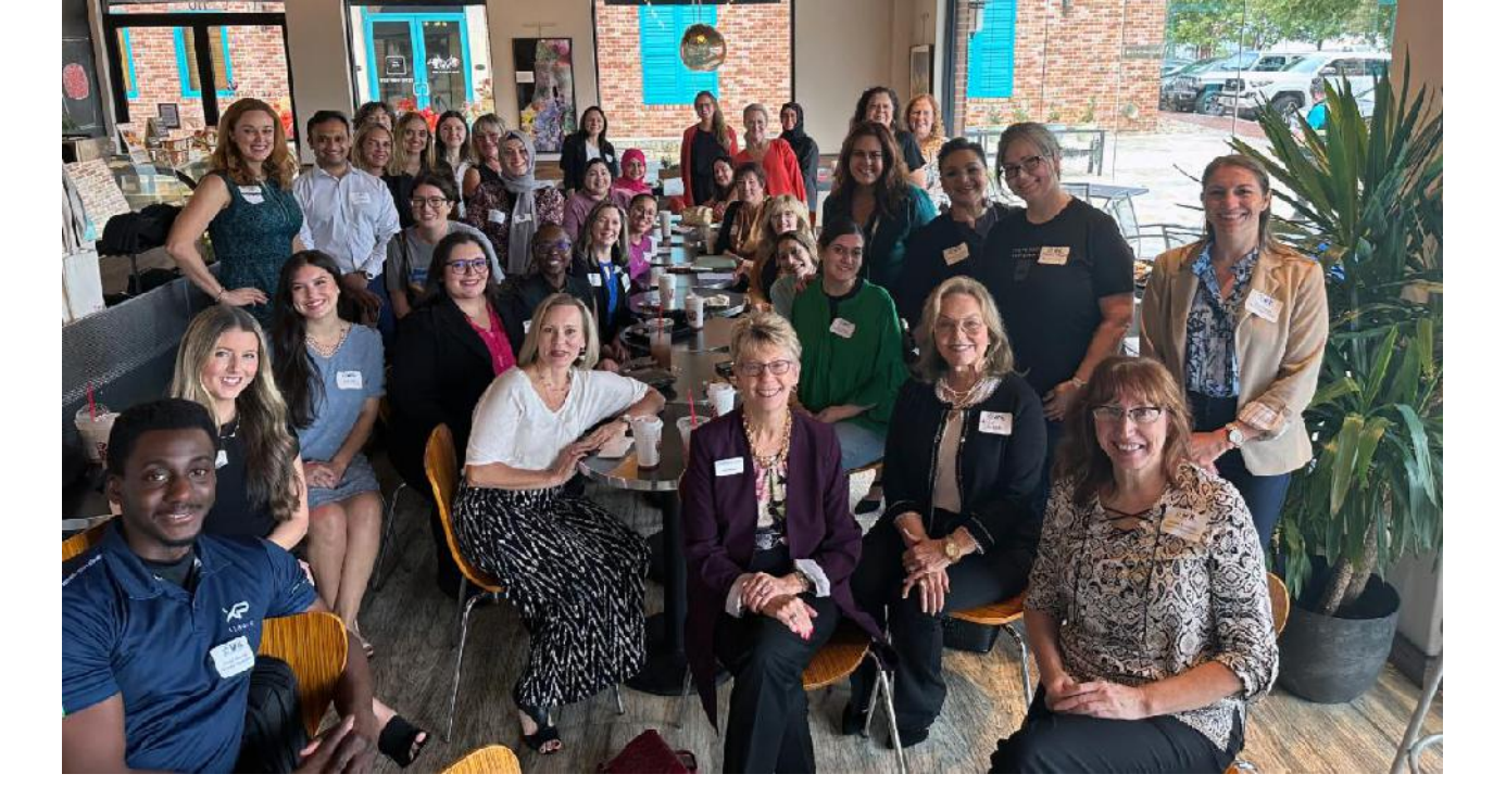
WIL started their day with breakfast and networking at Sweetwaters Coffee & Tea on October 5.