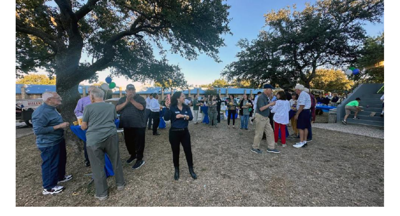
Member Connections enjoyed a Happy Hour on the lawn, hosted by Assurnet Insurance Agency on October 19.